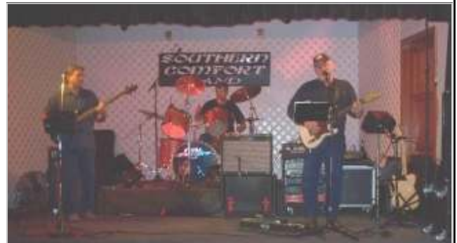
If you haven't heard the "Southern Comfort Band" perform you've missed out. They really did a great job during the Annual Bash!